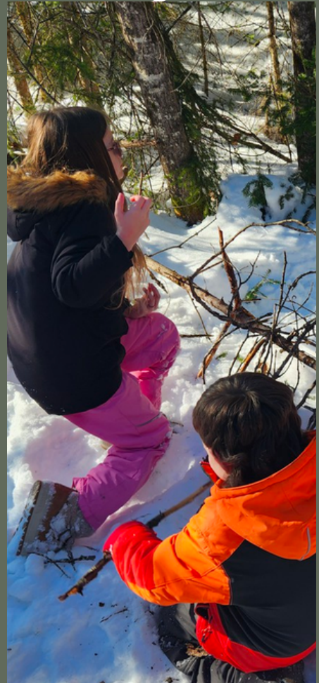
Outdoor day @Walden