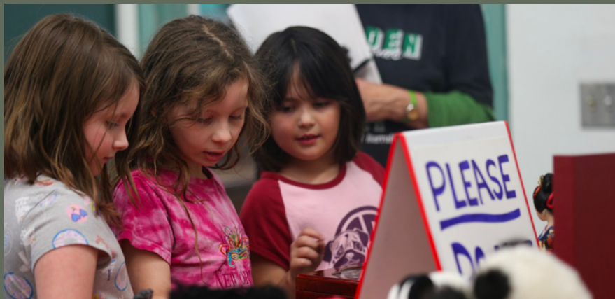
Book swap @Walden