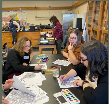
Jan. 27 PD Day