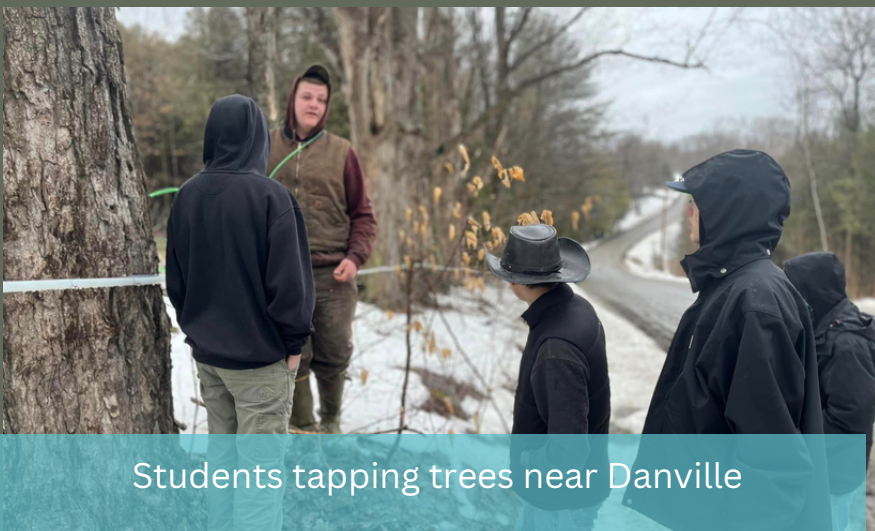
Students tapping trees near Danville